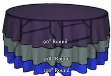
60" Round Table